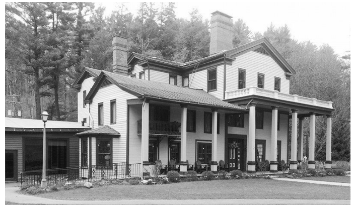
Glen Iris Inn