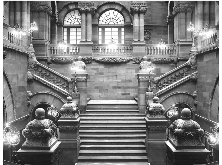
Million Dollar Staircase

6:30am – Extended Continental Breakfast at our Hotel