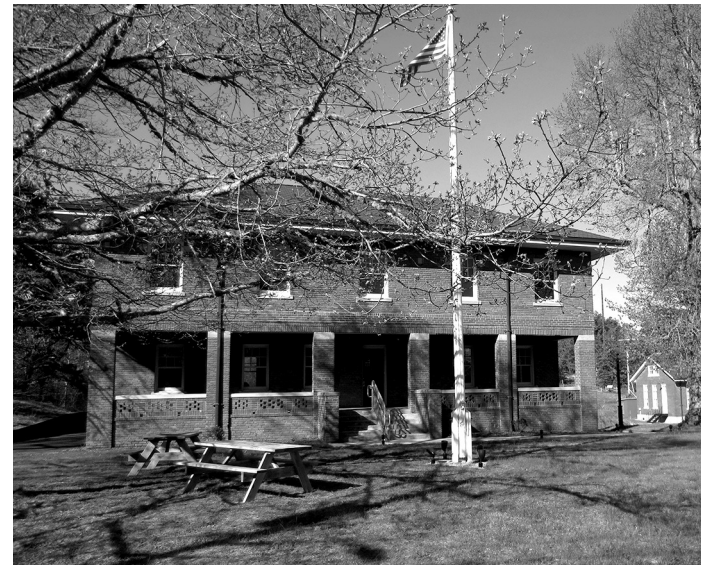
Maconi-RCA Wireless Museum

Early Afternoon: Admission to Marconi-RCA Wireless Museum. You will explore radio pioneer Guglielmo Marconi's life and legacy. Ship to shore radio. Learn