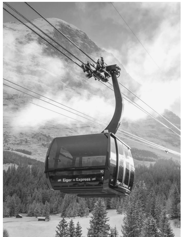
Swiss Cable Car