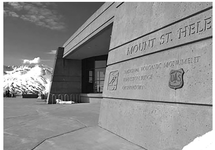
Johnston Ridge Observatory