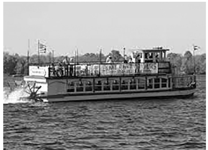
Barbara J - Sternwheeler 14

Office: Conneaut Lake & NW Pa – August, 2025