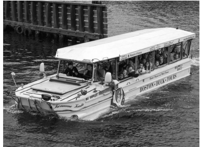
Boston Duck Ride

10am – Arrive at the New England Aquarium – where we will walk one block to the Marriott Hotel for the nice restrooms