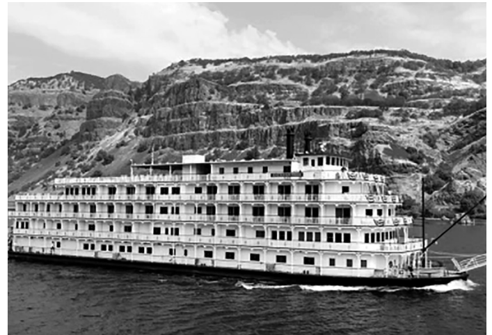
Columbia River Cruise

Notice: Since airlines only start to give prices 11 months before a given airport departure and since this tour is quite a time period away, Way To Go Tours has not received a firm price for this tour from The American Cruise Lines. This fabulous tour will be covered in a future brochure when we have complete information.