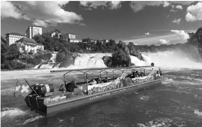
Rhine River Boat Ride

Way To Go Tours - Jerry Waldkoetter & Kathy Burkett - 716-693-0793