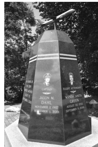
Flight 93 National Memorial