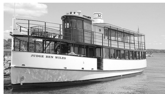
The Judge Ben Wiles