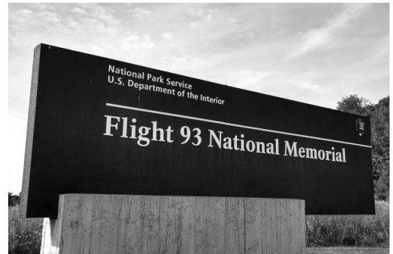
Flight 93 National Memorial Entrance