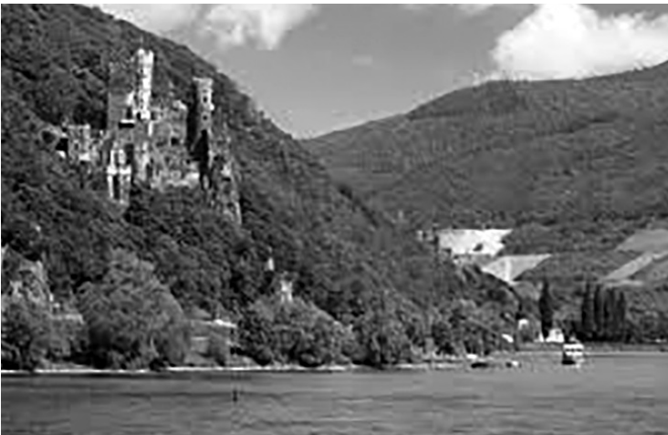
Castle in Germany