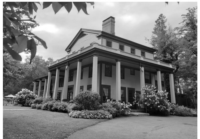
Glen Iris Inn