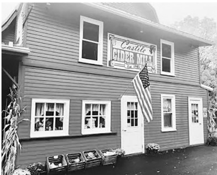
Castile Cider Mill