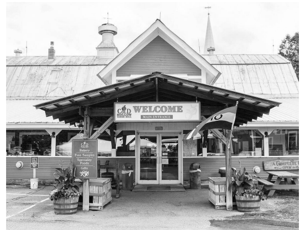
Cold Hollow Cider Mill