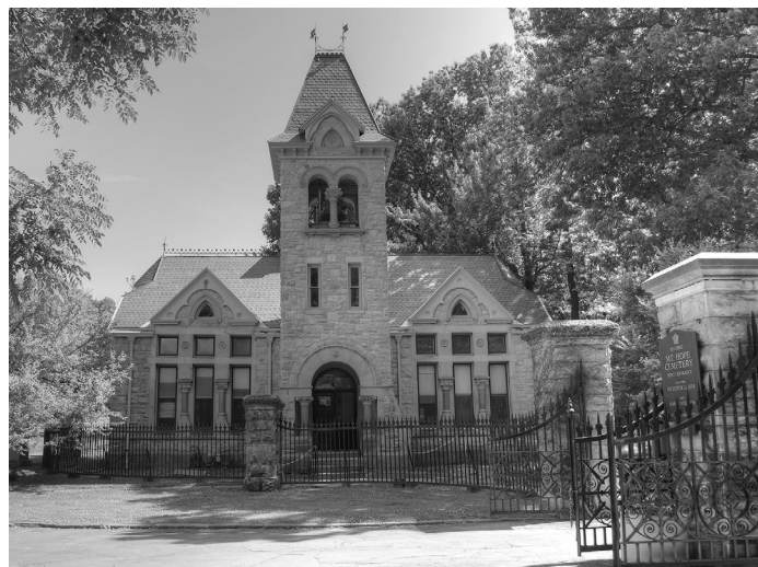
Mt. Hope Gate House