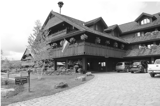
VonTrapp Family Lodge