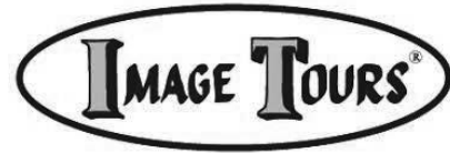
Image Tours has specialized in touring Europe since 1960! Join us on this 8 day, 7 Country tour.

Thursday, Sept. 24 – Thursday, Oct. 8, 2026